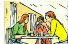
Talking with friends

Look at these three pictures. Tell a story about how these people could choose to be good and loving – or choose to be bad and mean.