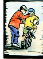
Learning to ride