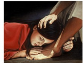
Based on Luke 7:36-50